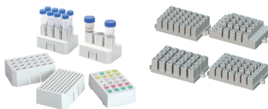
Blocks for TMS-200/TMS-300